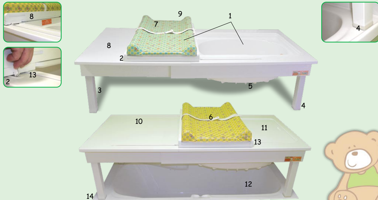
TUBmat®- Tough and Sturdy